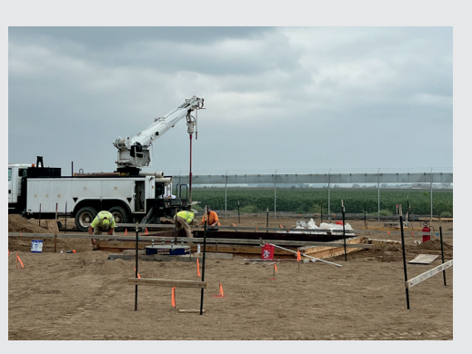
Broken ground and construction of new substation.

This substation dates back to the early 1960s. A new substation for the area will add necessary capacity, reliability, sustainability and new technologies. This will help better serve the northern most part of