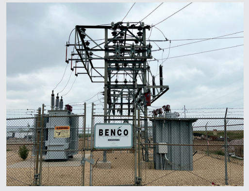
Existing substation dating back to the 1960s.

Last month BENCO broke ground to begin construction of a new Rush River substation. Our Rush River substation serves approximately 815 members and is located in Prairie Lake township. The substation is south of Nicollet County Road 8.